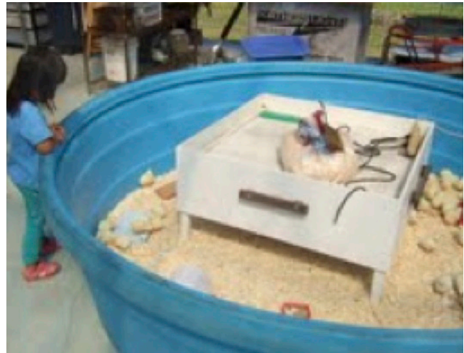
Figure 1. Brooder

Making a brooder and setting it up: The brooder can be made from a large cardboard box, plastic tote/storage