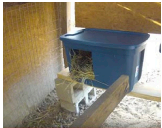
Figure 4. Homemade layer box

The basic purpose of a laying or nest box is to encourage hens to lay their eggs in a clean cubicle in relative peace and privacy. A properly built nest box assures that eggs are kept in a good environment for collection or hatching. Chickens are not particular about where they lay their eggs; however, a suitable nest box in which to