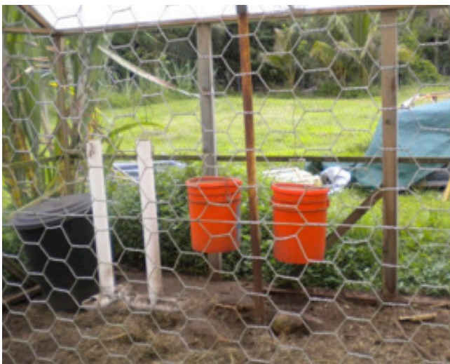
Figure 3. Self-watering system

Birds will adjust quickly to a nipple drinker; however, one or two birds must be trained how to use it before others will learn. Once the nipple drinker is installed, tap the nipple to get some water on your finger and introduce the water onto a bird's beak. Repeat this a couple of times. Chickens are naturally curious and will be drawn to the orange color of the nipples or the glistening of the water. Once one bird learns, the others will follow suit. The bucket should hold water for several days but should be checked, refilled, and cleaned periodically.