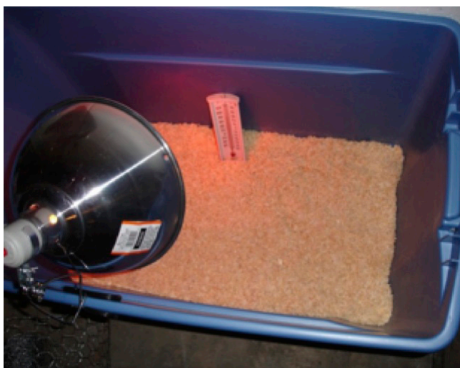
Figure 2. Heat source; picture courtesy S. Fox

The heat source: The brooder ought to be heated to prevent chilling when raising baby chicks. A simple solution is a standard heat lamp with a 250-watt bulb and a thermometer (see Figure 2). The temperature for baby chicks’ first week after hatching should be approximately 95 degrees; gradually decrease the temperature by 5 degrees for each week thereafter. To accomplish this, hang the heat lamp centrally over the top of the